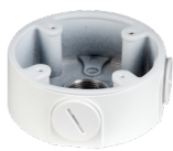
PFA13A-E Junction Box