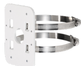
PFA152-E Pole Mount