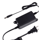
DH-PFM321D-US Power Adapter