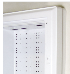
P3000 with 2 Frame Extenders stacked