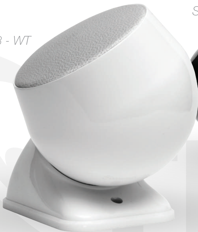
SAT3 - WT